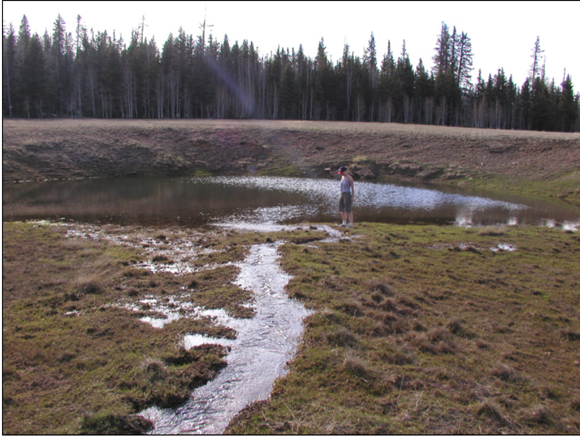
Figure 2. Recharge through sinkhole near the North Rim entrance gate on the Kaibab Plateau.